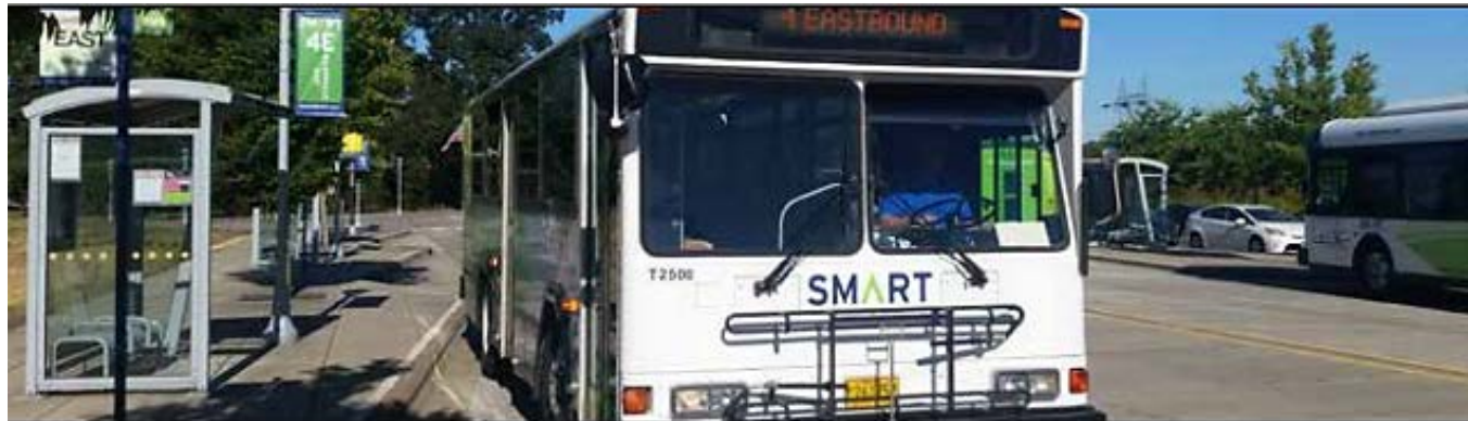
Notice of City of Wilsonville Public Hearing Wilsonville City Hall, 29799 SW Town Center Loop East SMART Programs Enhancement Strategy