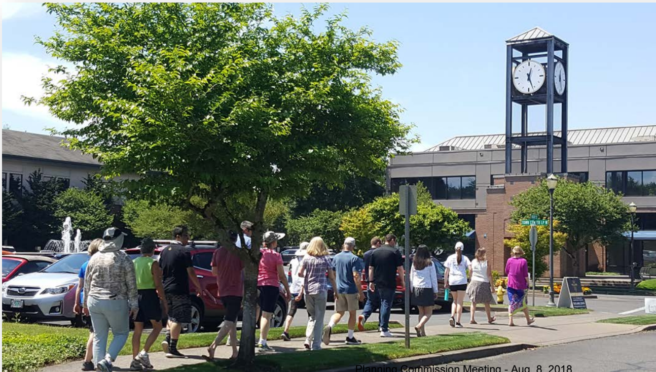
Planning Commission Meeting - Aug. 8, 2018 SMART Programs Enhancement Strategy

October 15 - City Council Public Hearing Reading 2