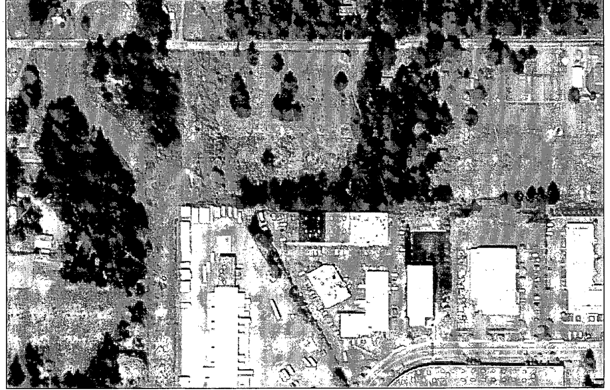
Aerial View of Project Site and Vicinity